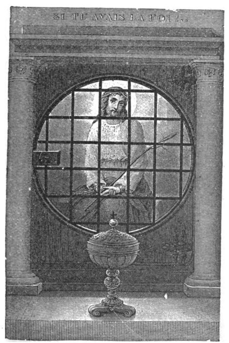
BEHOLD I AM ALWAYS WITH YOU.