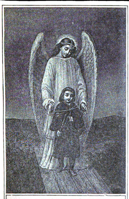
Celestial guardian thus with thee— And by thy constant care, May I the world's corruption flee And heavenly blessings share.